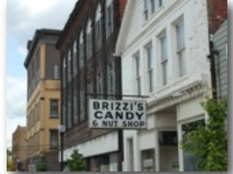
Brizzi Building, Blairsville, Indiana County