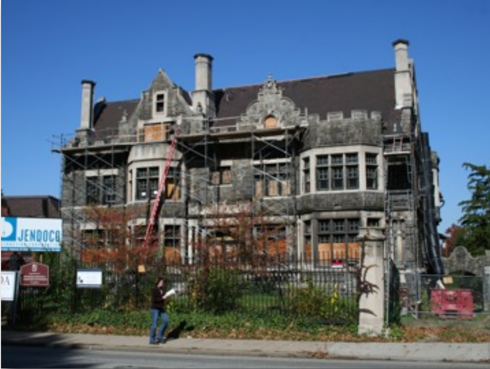
McCook Mansion, Shadyside