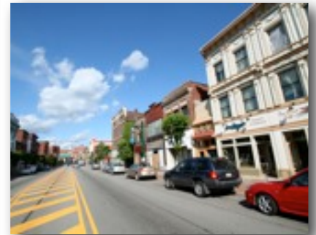
Homestead's East Eighth Avenue