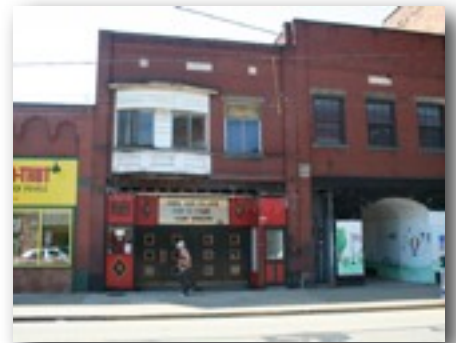
Ambridge Theater, Beaver County