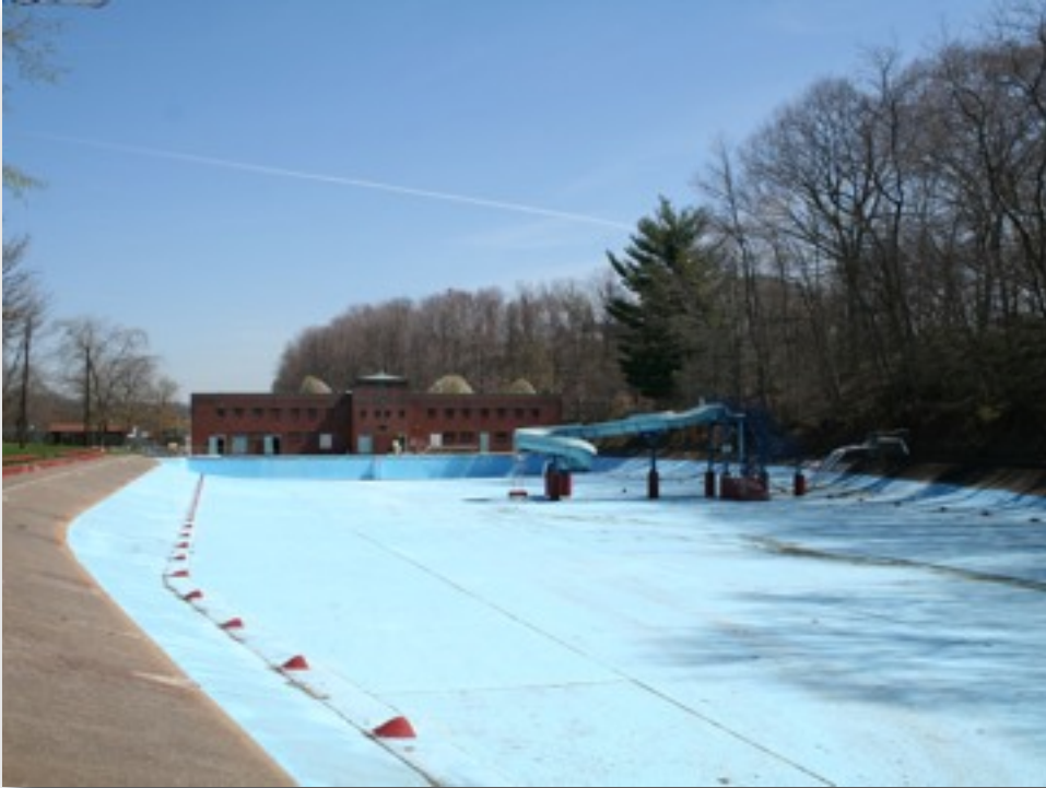
Dormont Pool, Allegheny County