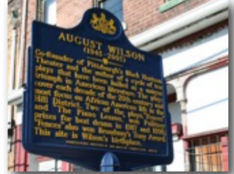
August Wilson Home, Hill District