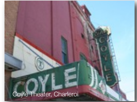
Coyle Theater, Charleroi