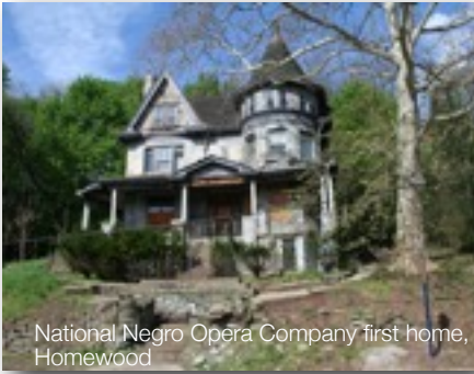
National Negro Opera Company first home, Homewood