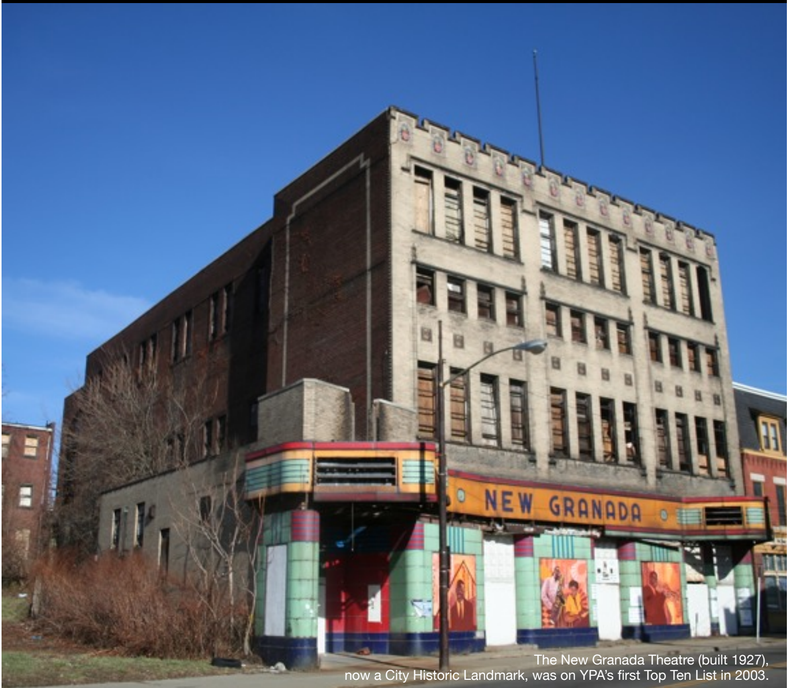
The New Granada Theatre (built 1927), now a City Historic Landmark, was on YPA's first Top Ten List in 2003.